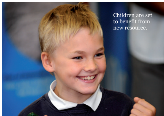
Children are set to benefit from new resource.

“It is wonderful to see her legacy being used in such a positive way.”