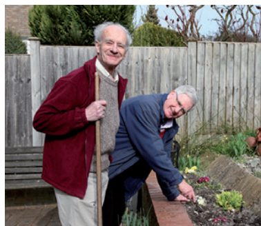
A volunteer helps with gardening.