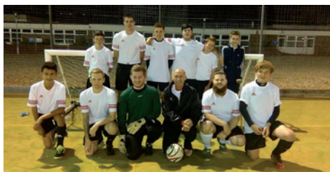
A team from the Fellowship Football league.

“In this way it should be possible for us to play without the need for any referees. We see this as a true test of the quality of our Christianity. Sadly, it is unrealistic to expect perfection in this. We are flawed human