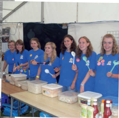
Members of Dunvant Christian Fellowship in the early years (left) and at an outreach event.

A church in South Wales is celebrating 100 years in service by holding a series of outreach events aimed at winning back the lost.