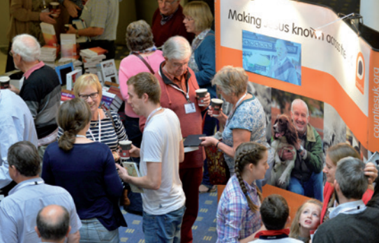
Delegates enjoy the exhibitions on display.